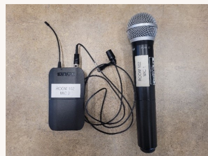
Wireless and Lapel Microphones